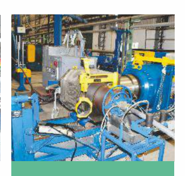
Lead Sheathing Line