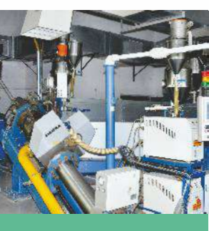
550 kV Maillefer HVCV Insulate Line